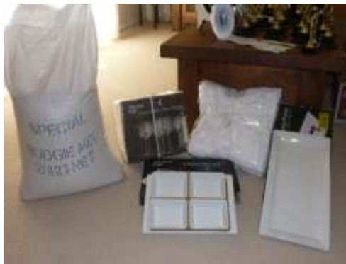
Raffle prizes your choice of prizes Bag of Seed, set glasses, set towels, rectangular platter, 5 piece platter set