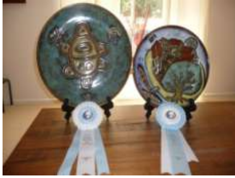
Grand Champion & Champion O/S of Show Trophies (painted plates)