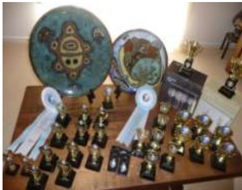
Some of the trophies for SCBA Annual Show